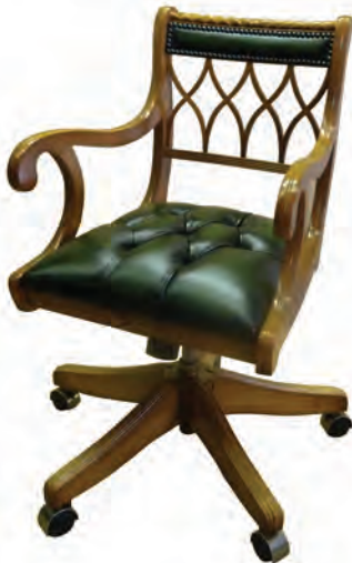
Gothic Swivel Button Seat