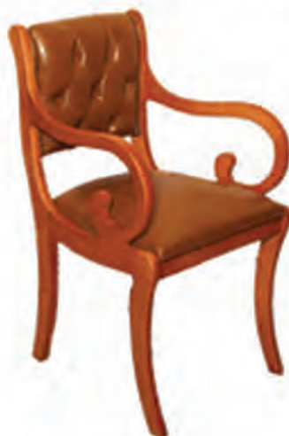
Enfield Carver Chair Button Back/Plain Seat