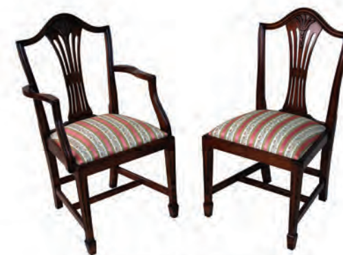
DCH-5 Wheatear High Back