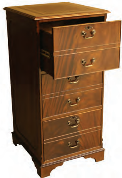
3 Drawer Filing Cabinet (FC-2)