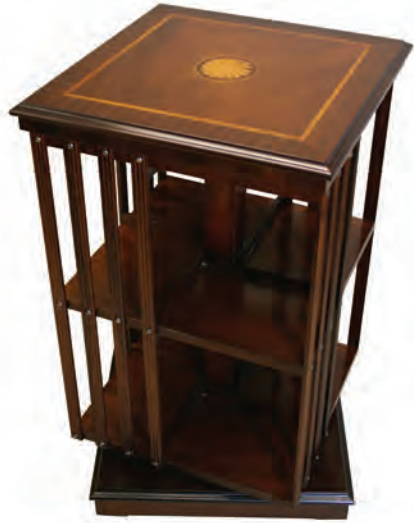
REVBC-1 Polished Top