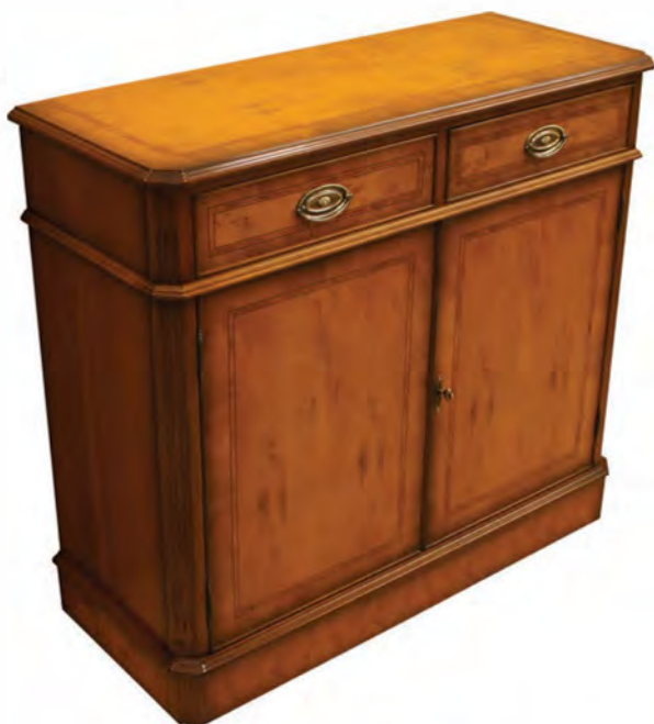
INSB-2 2 Door Inadam Sideboard in Yew with Tulip Inlay and Oval Plate Handles