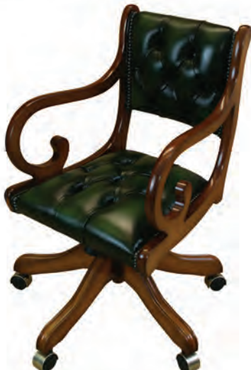
Regency Carver Swivel Button Back/Seat