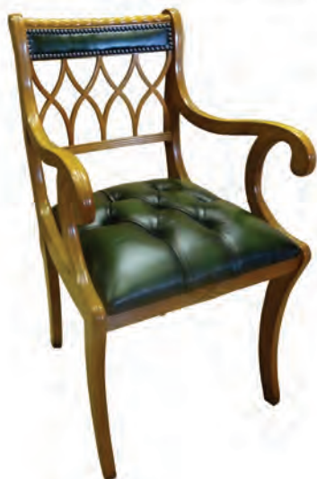
Gothic Visitor Chair Button Seat