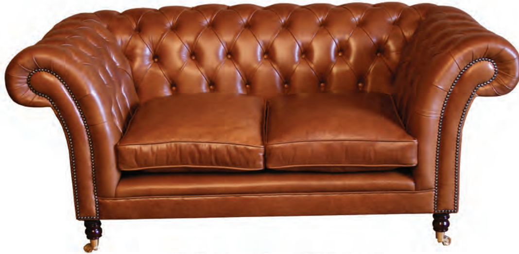
The Kensington Chesterfield Collection