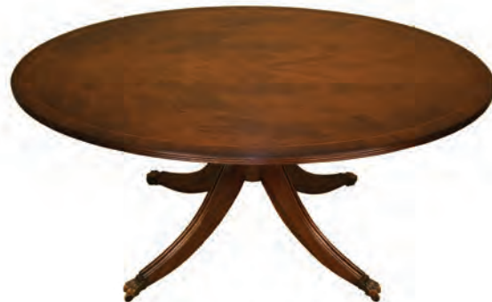
Round/Oval Coffee Table no rim