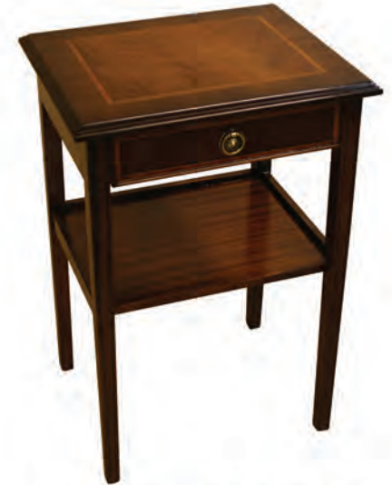
OCC-1 Small 2 Tier Table