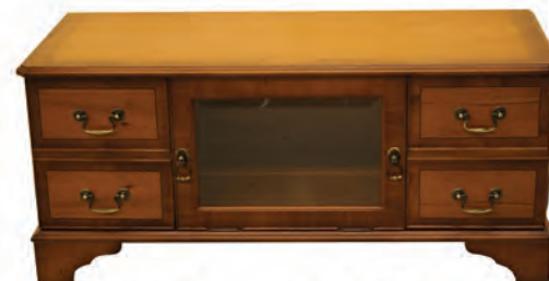
SAV-16 Glass and Solid flap options