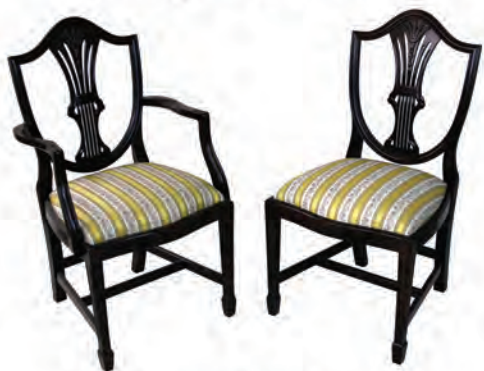
DCH-1 Shield Back Wheatear