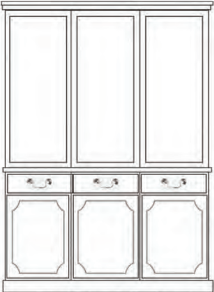
LB-R-3D / LB-RB-3D LB-G-3D / LB-GB-3D