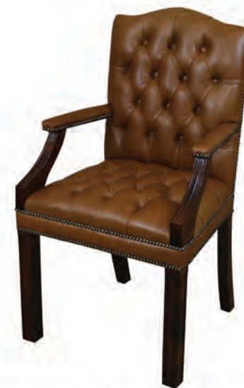
Mini Gainsborough Chair Button Back/Seat