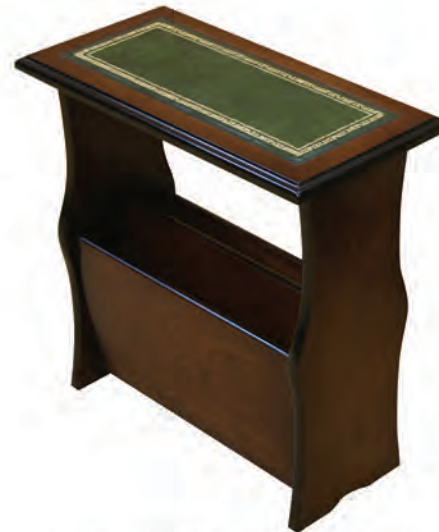
Magazine Table Leather top