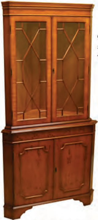
Corner Cabinets are only available with Bevelled Glass

Corner cabinets are available in all of the wood finishes