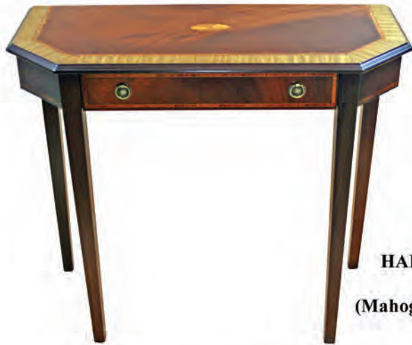
HALL-1 Tapered Leg 1 Drawer Hall Table (Mahogany/Satin/Tulip Delux Option)