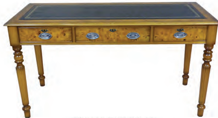
Victorian Writing Table

Arch Bookcases can be made to join together in a modular run if required