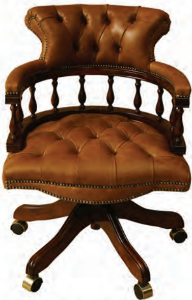
Captain Swivel Button Seat