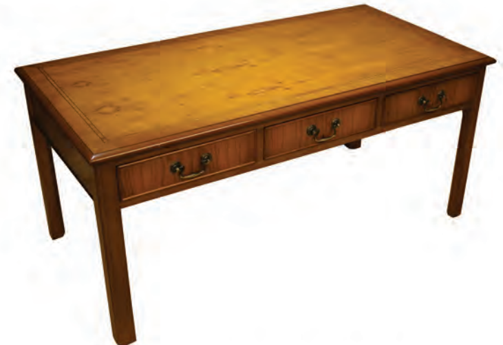
CHIP-5 Chippendale Coffee Table with 6 drawers