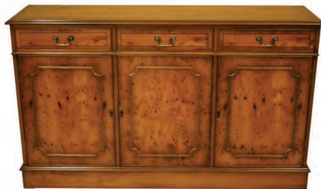
3 Door Regency Sideboard