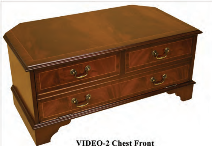
VIDEO-2 Chest Front Corner TV Cabinet