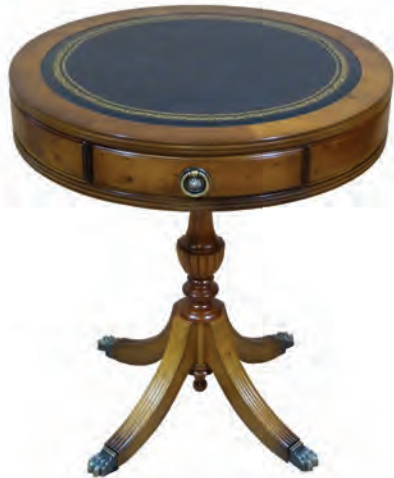
DRUM-2 Leather Top