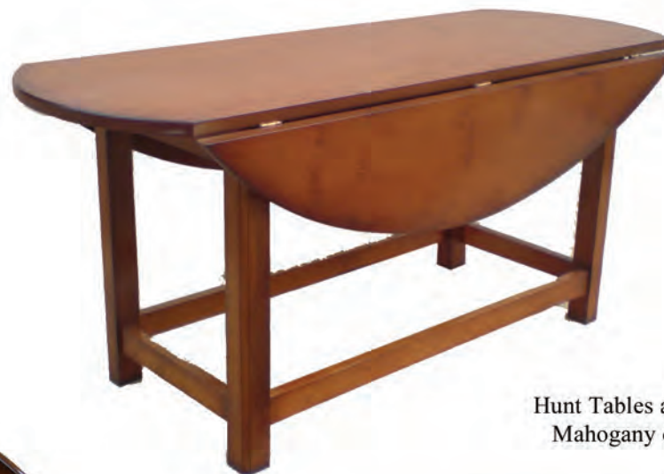
Hunt Tables are available in Mahogany or Yew finish