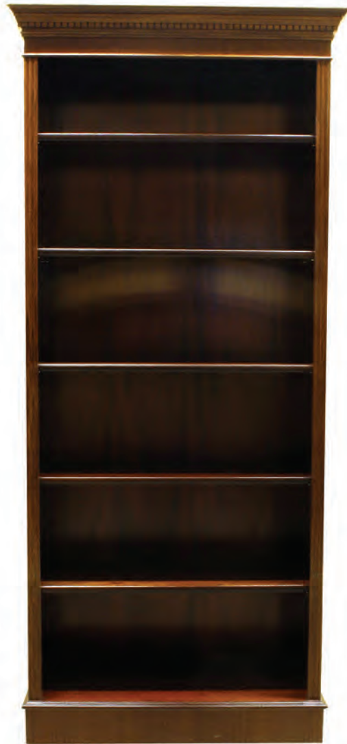
Georgian Tall Open Bookcase