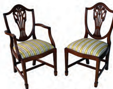
DCH-4 Prince of Wales