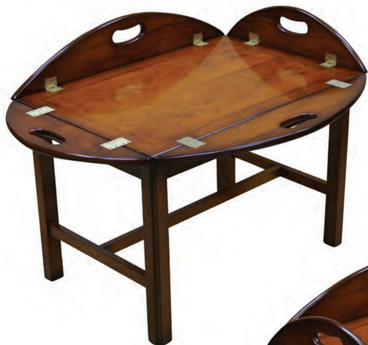
Butlers Trays are available in Mahogany or Yew finish