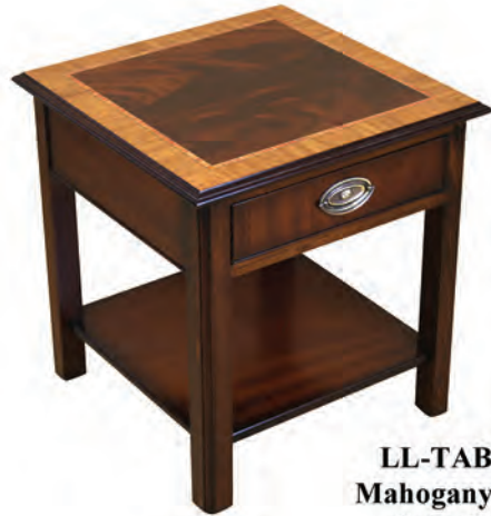
LL-TABLE-1 & LL-TABLE-2 Mahogany finish with Tulip Inlay & Satinwood Cross banding