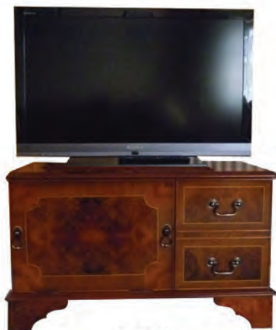
SAV-6 Glass and solid flap options