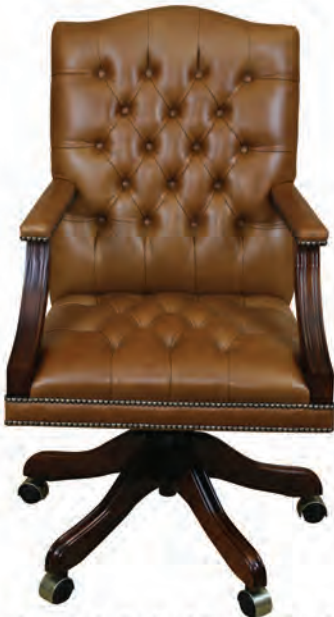
Gaibsborough Swivel Button Back/Seat