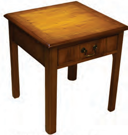
CHIP-2 Lamp Table with drawer