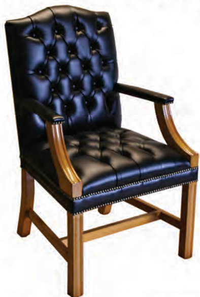
Gainsborough Chair Button Back/Seat

Enfield Chairs come with the option of 1/2 Saddle or 'FS product codes' are for a Full Saddle