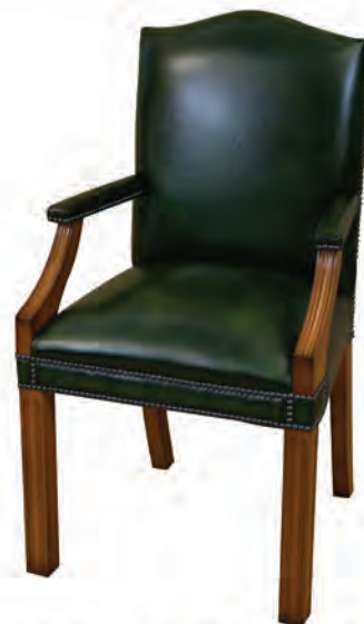
Mini Gainsborough Chair Plain Back/Seat