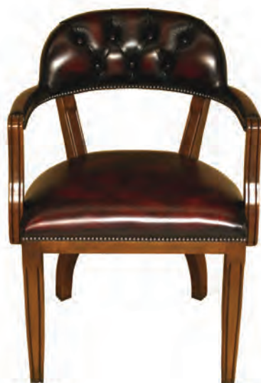
Court Chair Button Back/Plain Seat