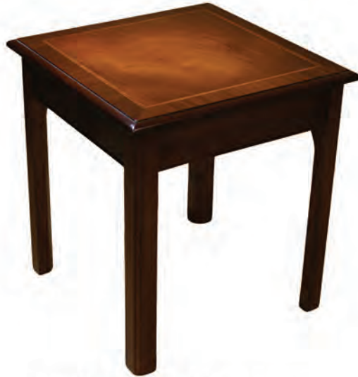
CHIP-1 Lamp Table no drawer