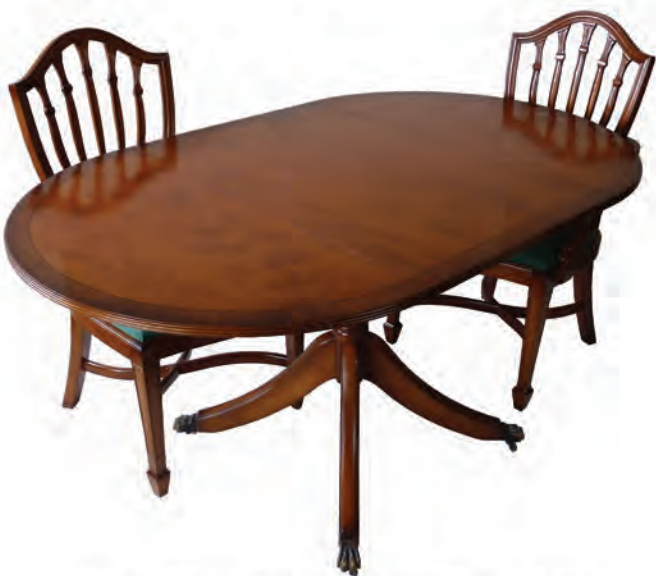
5' Bow End Dining Table without Rim in Yew with Candle Stick dining chairs