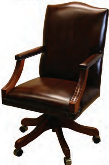
Mini Gainsborough Swivel Plain Back/Seat