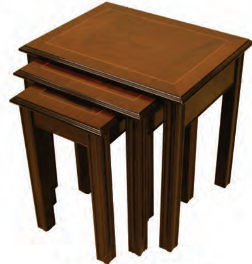
NEST-3 Chippendale Nest