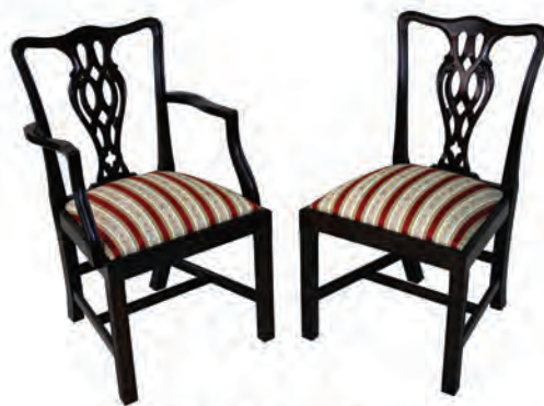
DCH-3 Ribbon Back