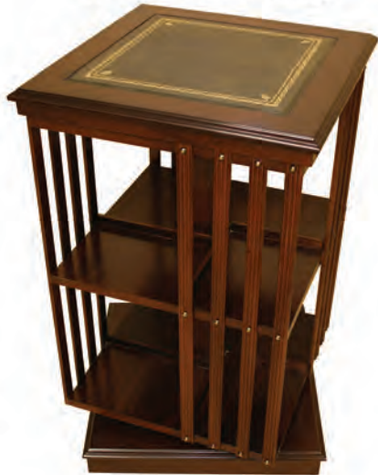
REVBC-1LEA Leather Top