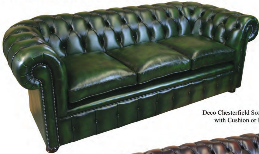
Deco Chesterfield Sofas are available with Cushion or Button Seat