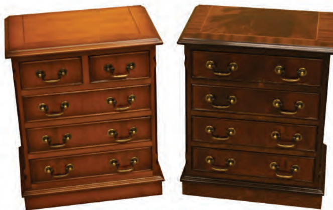
Mini 4 and 5 Drawer Chests of Drawers