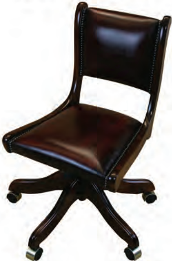
Regency Single Swivel Plain Back/Seat