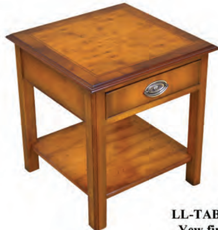
LL-TABLE-1 & LL-TABLE-2 Yew finish with Tulip Inlay & Curl Mahogany Cross banding