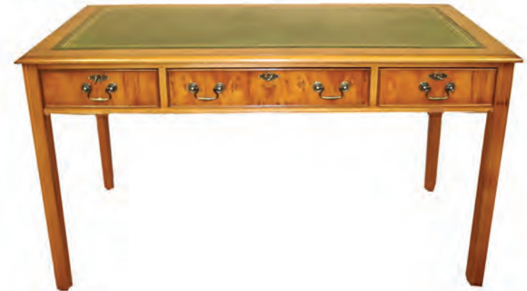
Chippendale Writing Table