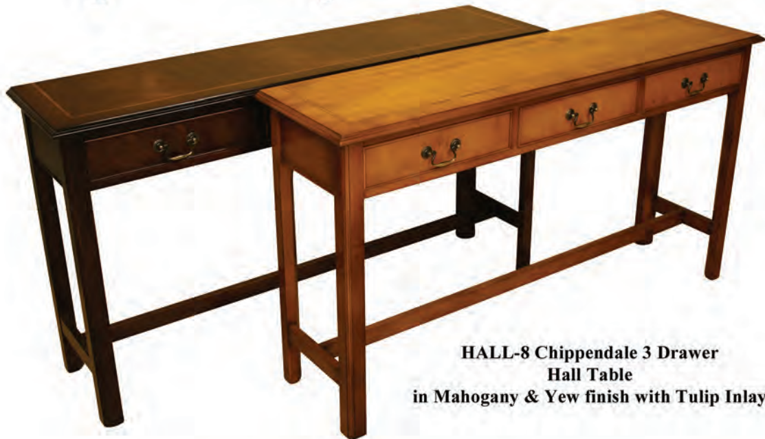
HALL-8 Chippendale 3 Drawer Hall Table in Mahogany & Yew finish with Tulip Inlay