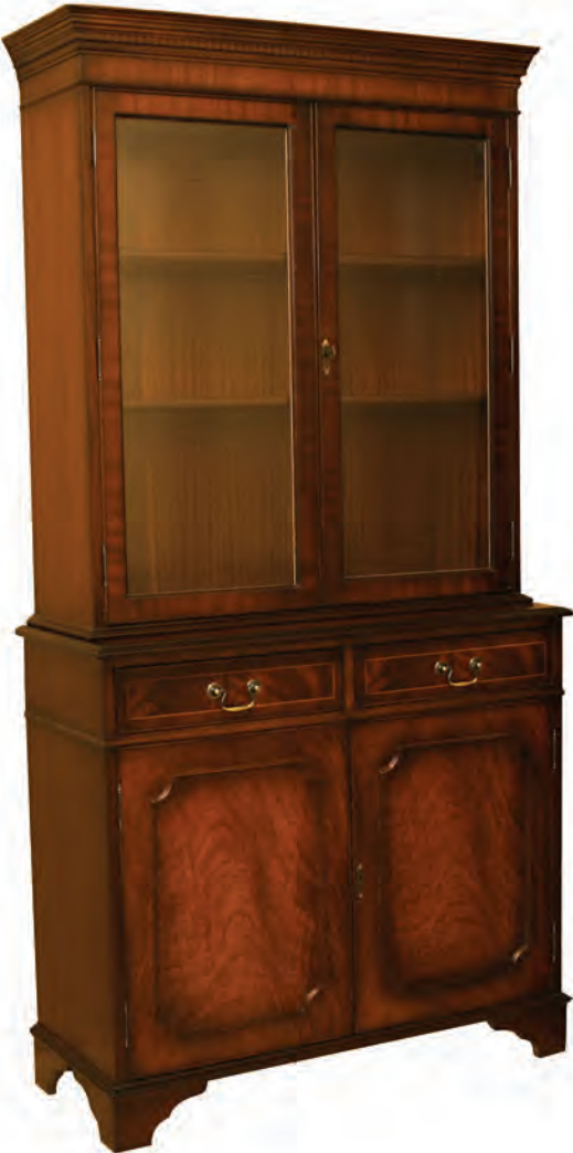
2 Door Regency Library Bookcase

Birdseye view of a break front library bookcase