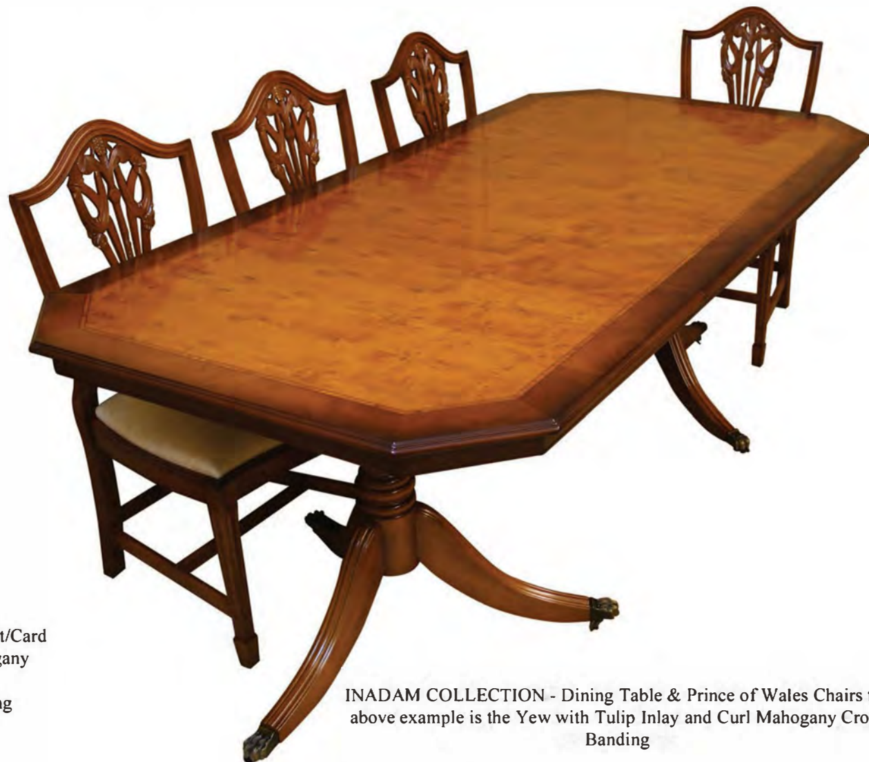
INADAM COLLECTION - Dining Table & Prince of Wales Chairs the above example is the Yew with Tulip Inlay and Curl Mahogany Cross Banding