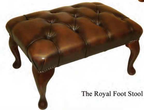
The Royal Foot Stool