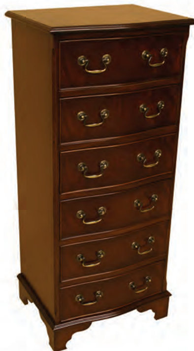
20" 6 Drawer Serpentine