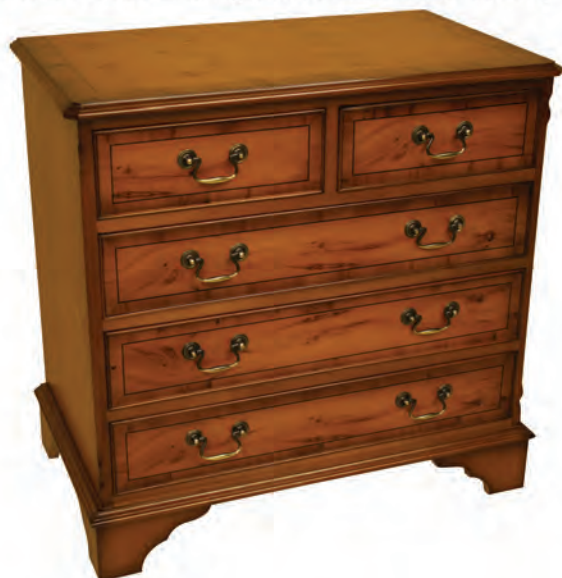
5 Drawer Flat Front (drawer inlays as option)