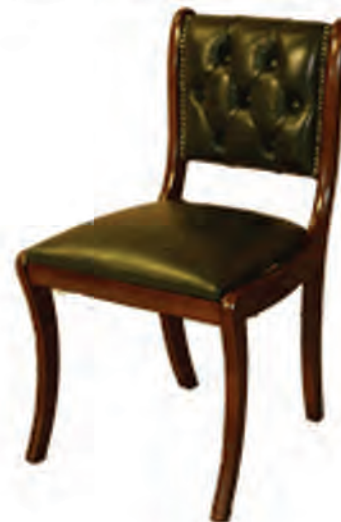
Enfield Single Chair Button Back/Plain Seat