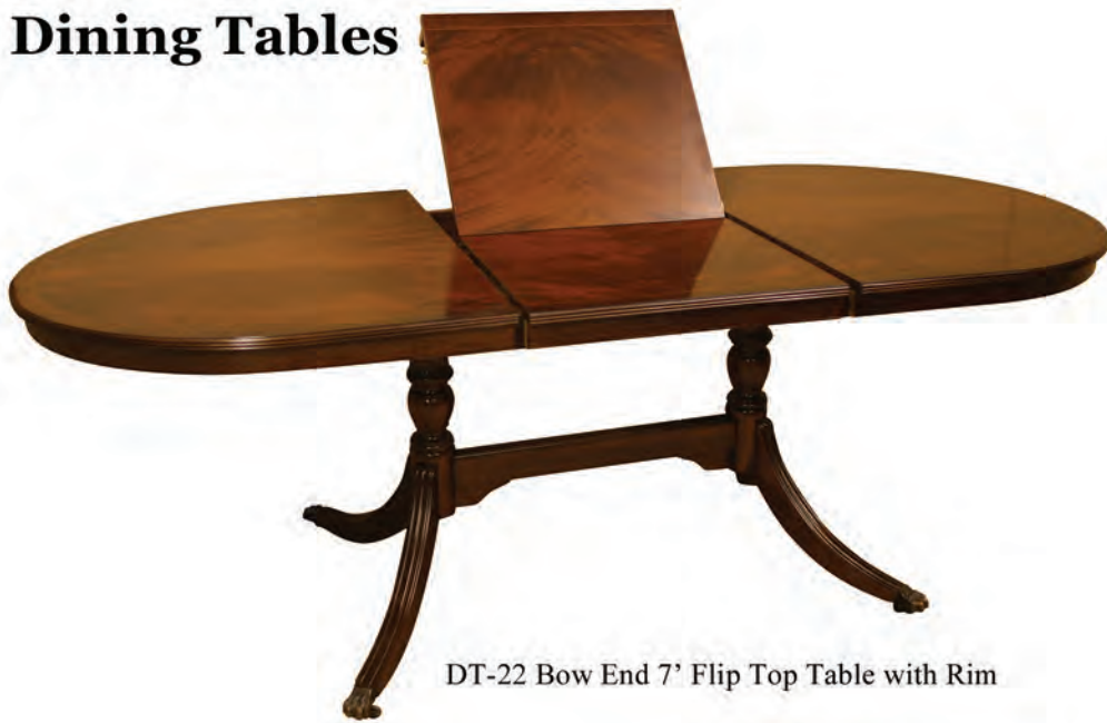
DT-22 Bow End 7' Flip Top Table with Rim