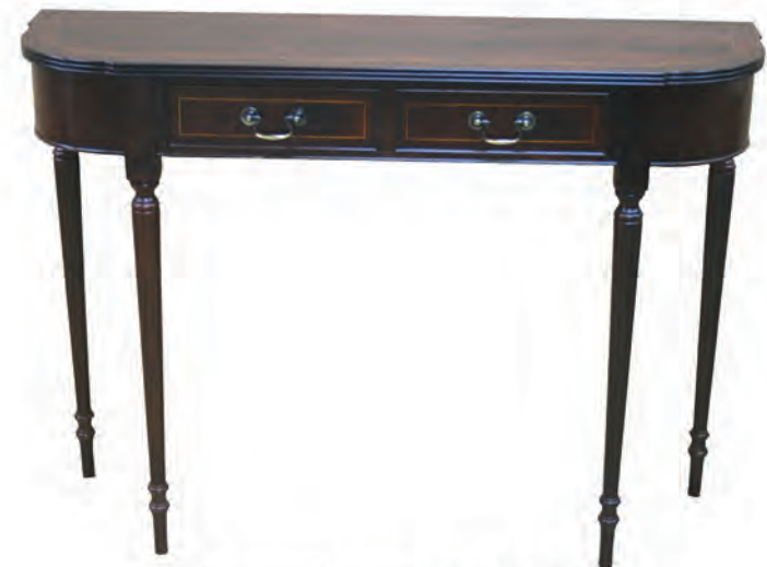
HALL-11 2 Drawer Bow Hall Table