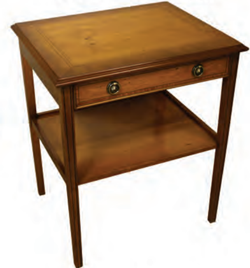
OCC-2 Large 2 Tier Table