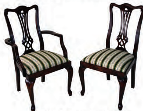
DCH-11 Queen Ann Leg