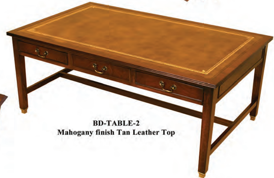
BD-TABLE-2 Mahogany finish Tan Leather Top