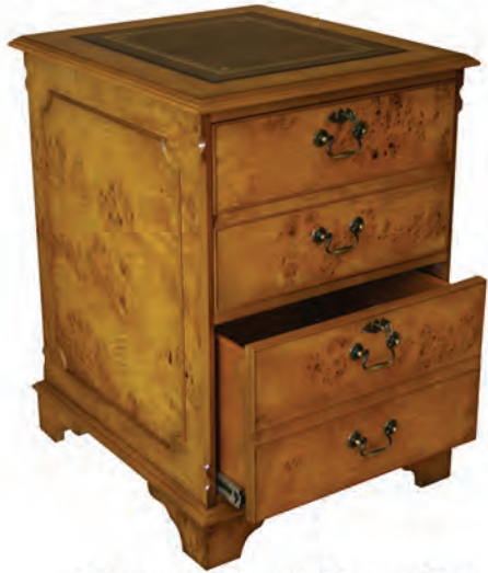
2 Drawer Filing Cabinet (FC-1)