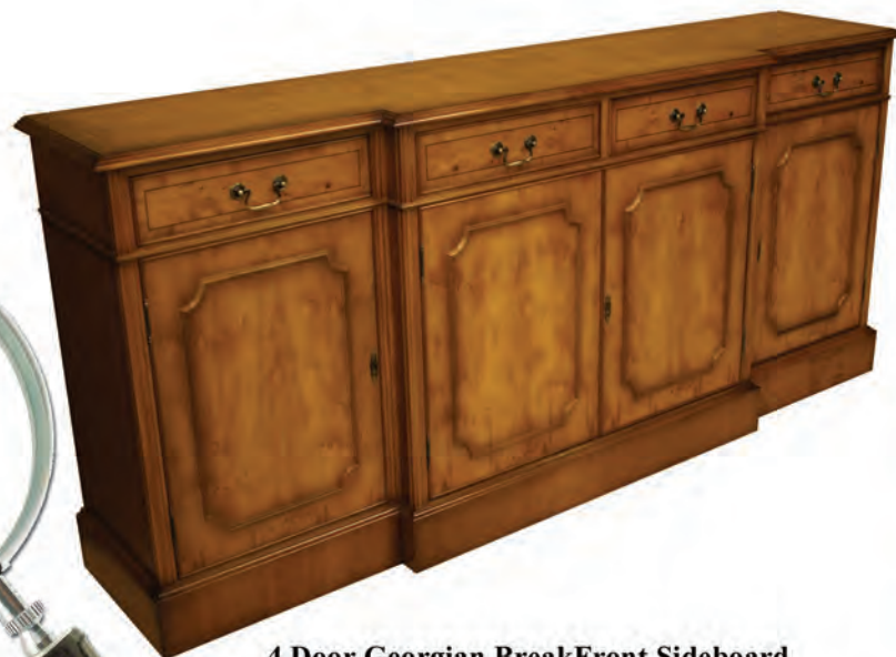
4 Door Georgian BreakFront Sideboard

Our Sideboards are available in Regency or Georgian design.