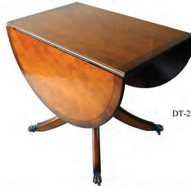
DT-27 Bow End Pembroke Table