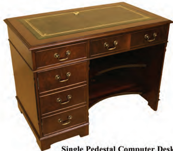
Single Pedestal Computer Desk