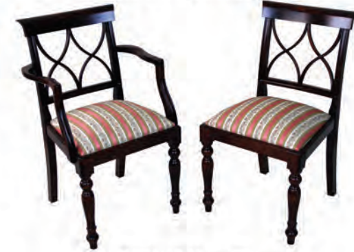
DCH-13 Hour Glass