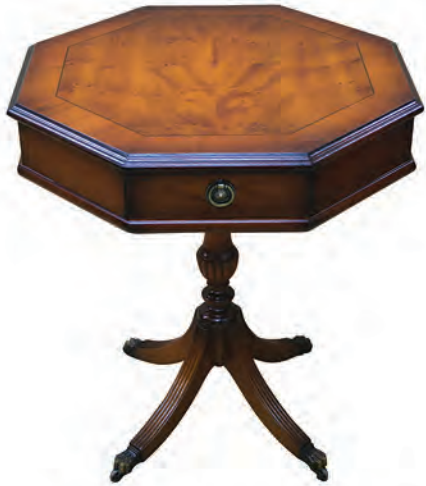
DRUM-3 Polished Top

All of our Chippendale tables come with a standard black or white line inlay As a delux option we also offer 'Tulip Inlays'