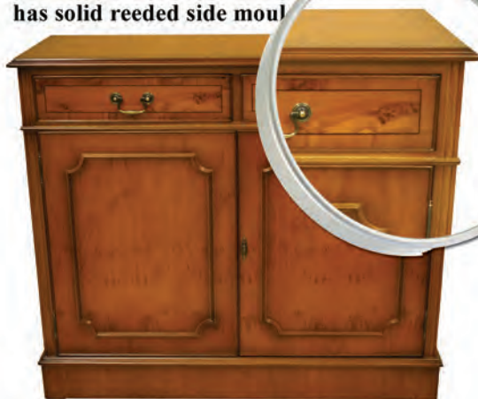
2 Door Georgian Sideboard