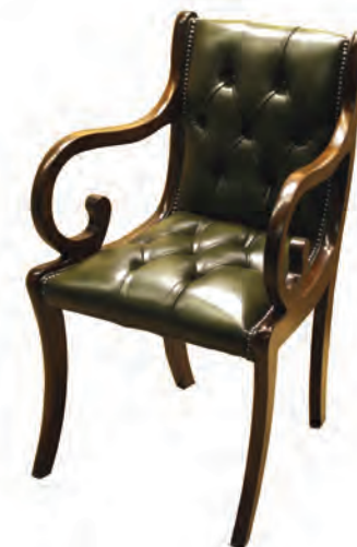
Enfield Carver Full Saddle Button Back/Seat