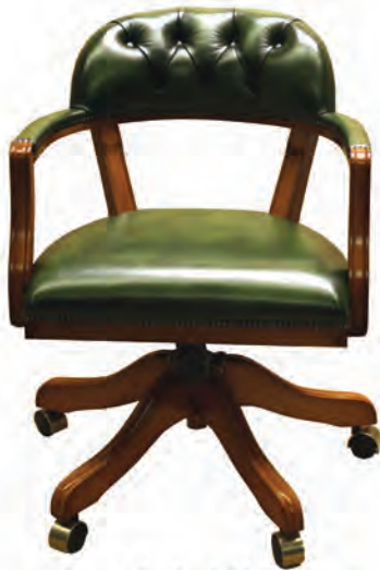
Court Swivel Plain Seat