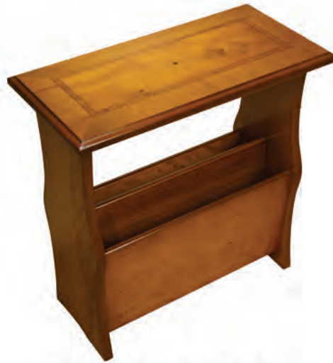
Magazine Table Polished Top with Tulip Inlay