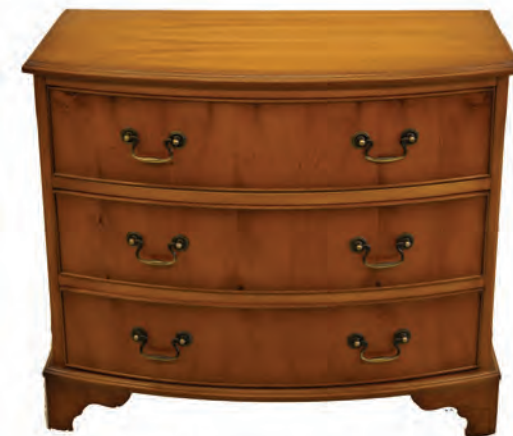
30" 3 Drawer Bow Front