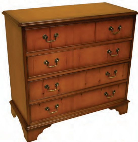
4 Drawer Flat Front (plain drawers as standard)