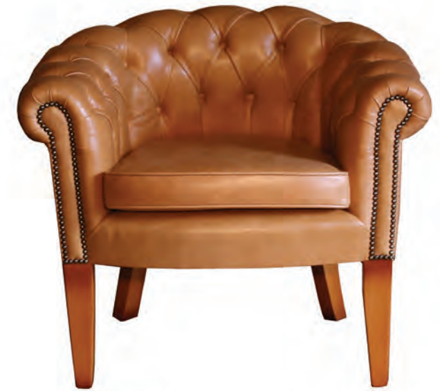
The Tub Chair is available with a Cushion or Buttoned Seat