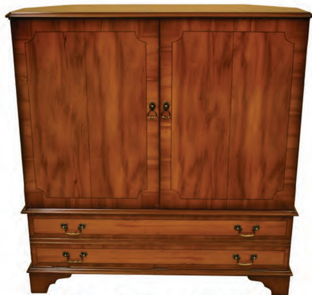
SAV-1/2 Fully Enclosed TV Cabinet