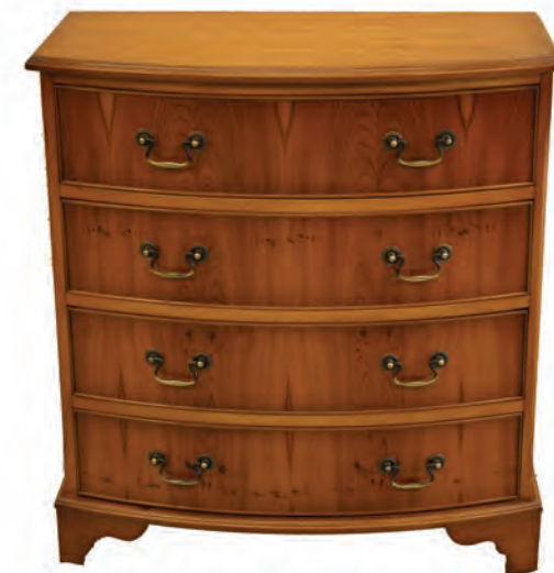
30" 4 Drawer Bow Front