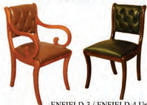
ENFIELD-3 / ENFIELD-4 Upholstered Back