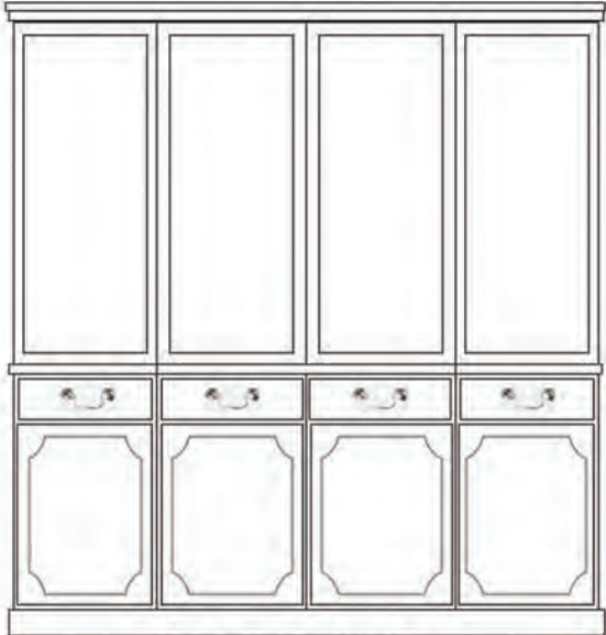
LB-R-4D / LB-RB-4D LB-G-4D / LB-GB-4D

Our library bookcases are available in Regency or Georgian design.