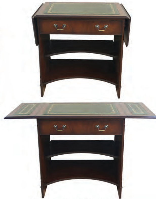
Extending Desk (ED-PD/ED-CD)