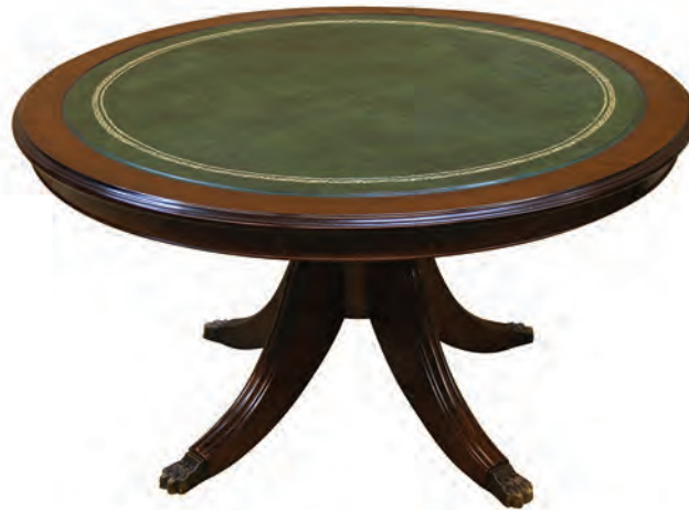
Round/Oval Coffee Table with Rim & Leather Top