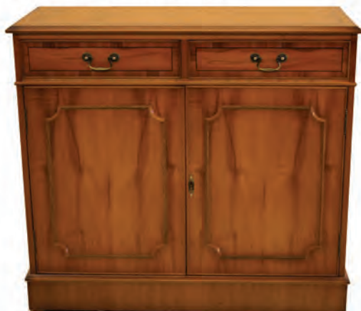
2 Door Regency Sideboard