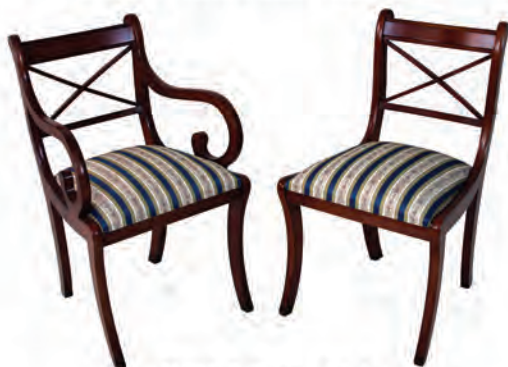
DCH-8 Cross Stick