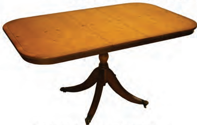
5' D End Dining Table with Rim in Yew

The standard Bow/D End dining tables have removable leaves to reduce the length of the tables