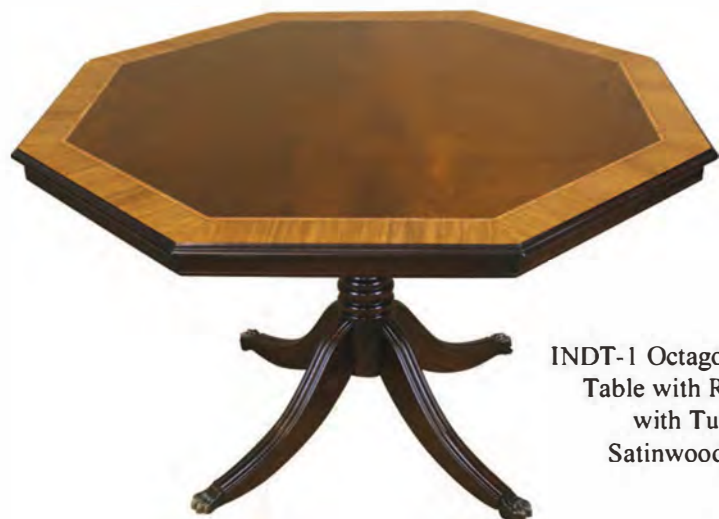
INDT-1 Octagonal Breakfast/Card Table with Rim in Mahogany with Tulip Inlay and Satinwood Crossbanding