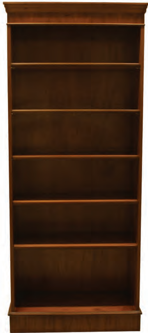
Regency Tall Open Bookcase