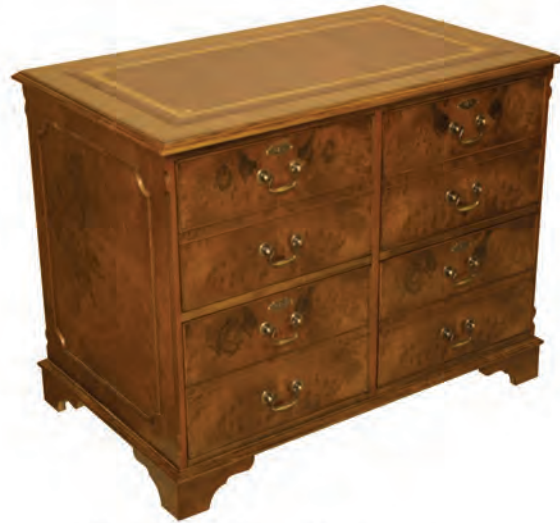
4 Drawer Filing Cabinet (FC-3)