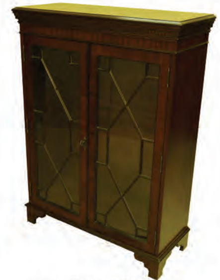
DISP-9 Tall Display Cabinet with Solid Sides

Display cabinets with glass sides have glass shelves