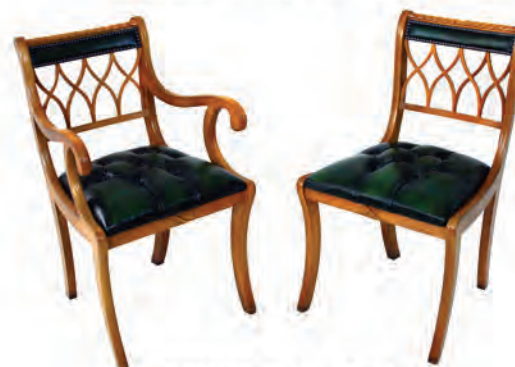
DCH-12 Gothic Back