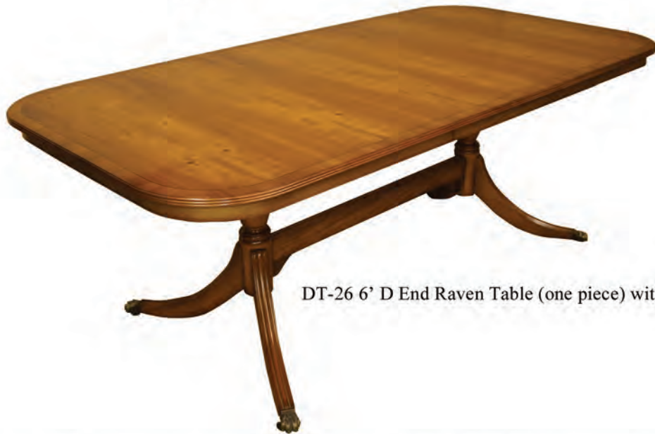
DT-26 6' D End Raven Table (one piece) with Rim