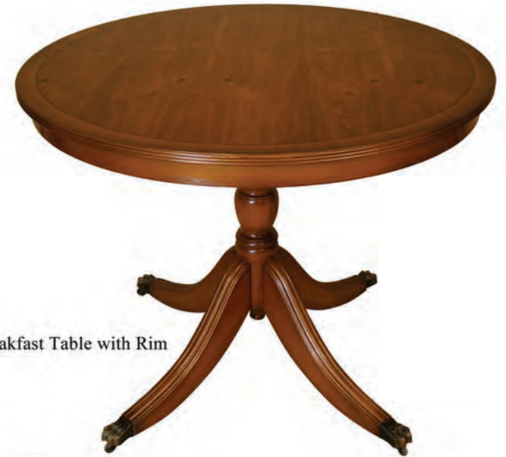
Circular Breakfast Table with Rim