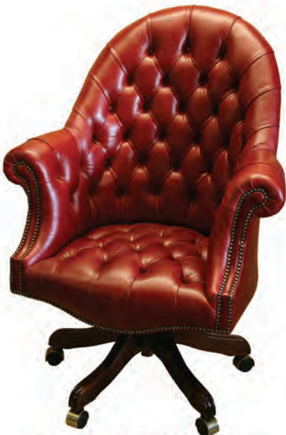
Executive Swivel Button Seat