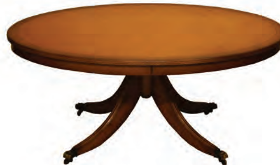
Round/Oval Coffee Table with rim